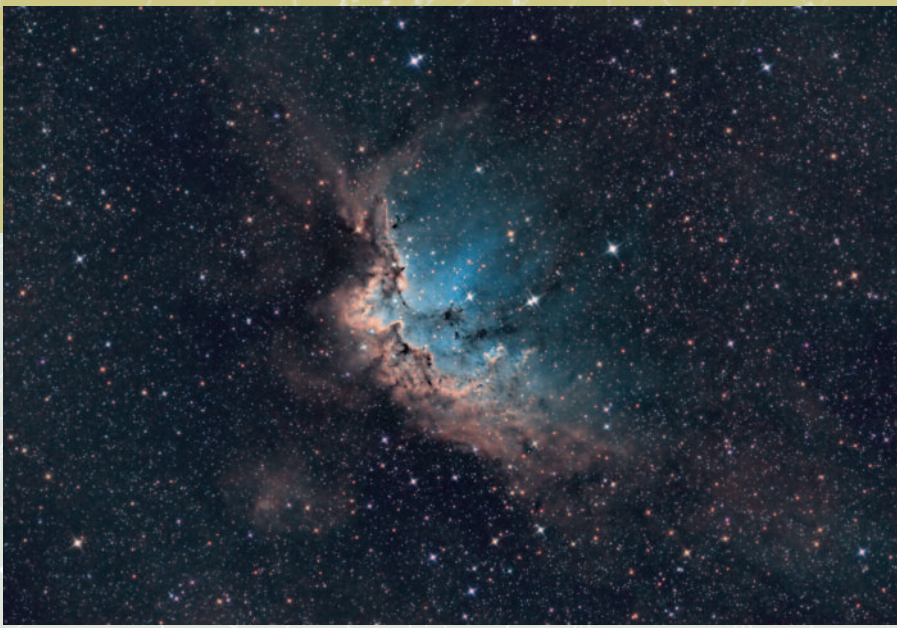
NGC7380 The Wizard Nebula is located about 7,200 light-years away, in the constellation Cepheus. This 6-hour image was taken from Calgary in July 2017 using a Tele Vue NP127is telescope and a QSI 583wsg camera.