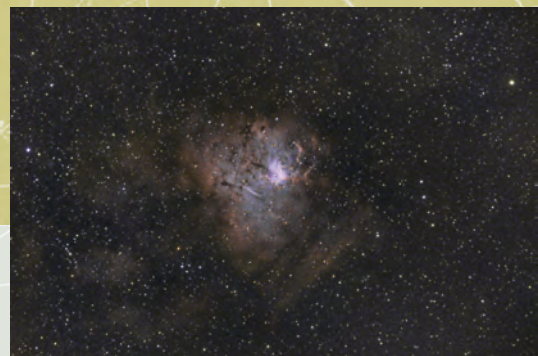
This 8-hour image of NGC1491 was taken with a Tele Vue NP127is telescope and a QSI 583wsg camera.