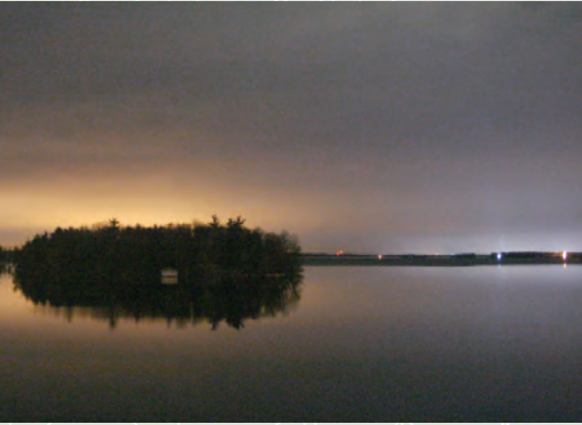
The increasing use of white-light luminaires (at right) in towns and cities is beginning to change the nature of urban sky glow.