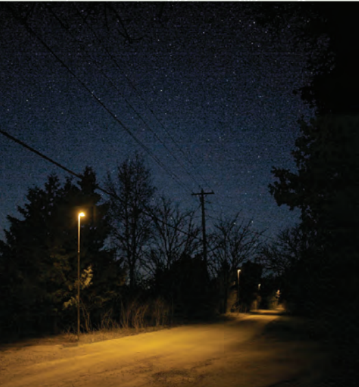
Pole-mounted low-impact lighting along a rural road. "Low impact" does not necessarily mean dim. However, spectrum, brightness, shielding and uniformity must be well defined. Photos and chart: Robert Dick