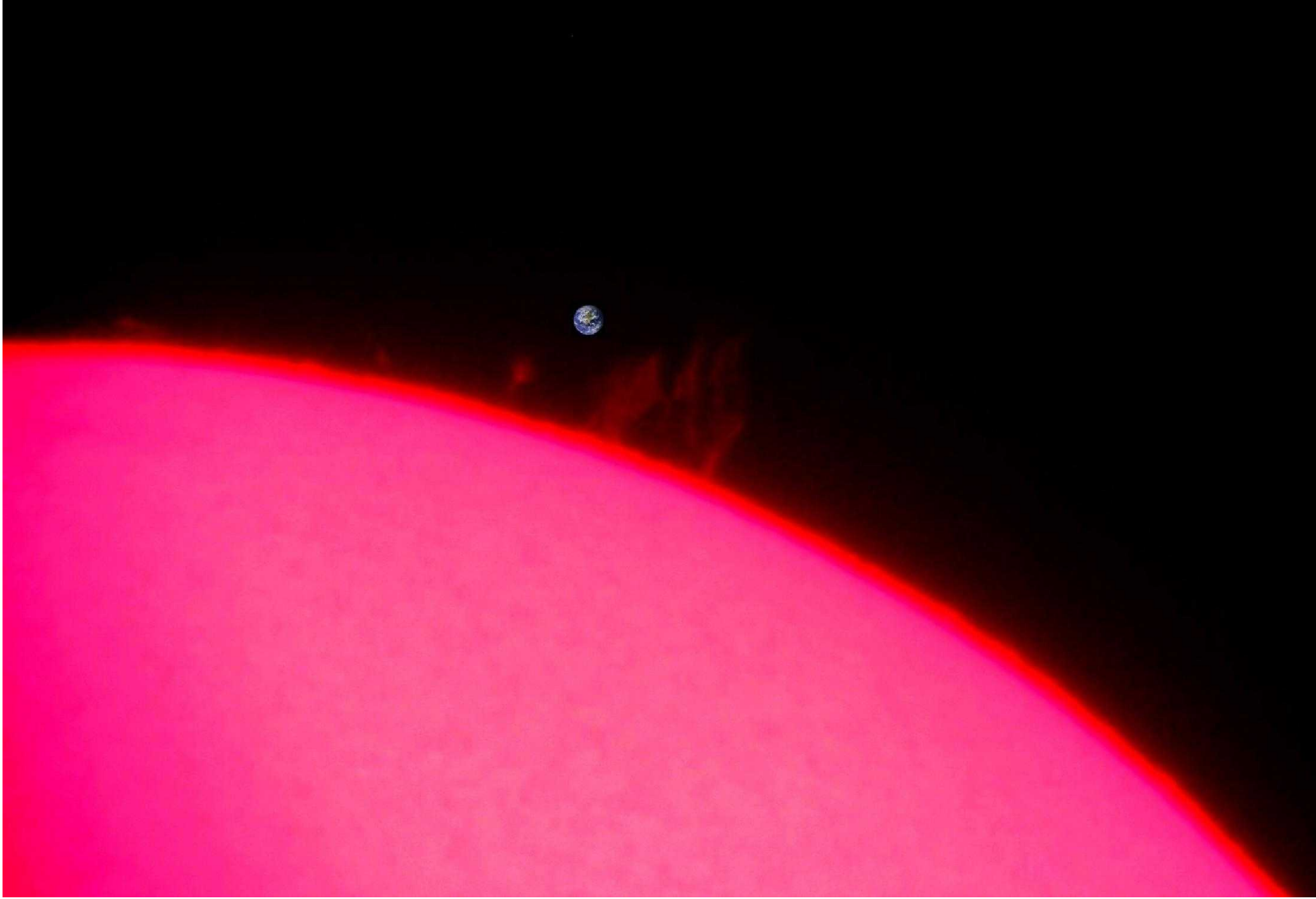
Solar Prominence, taken 2009 April 24