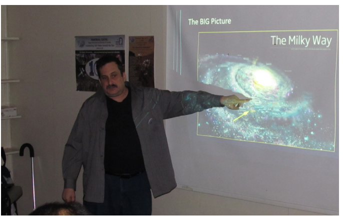
David Shuman: the Solar System