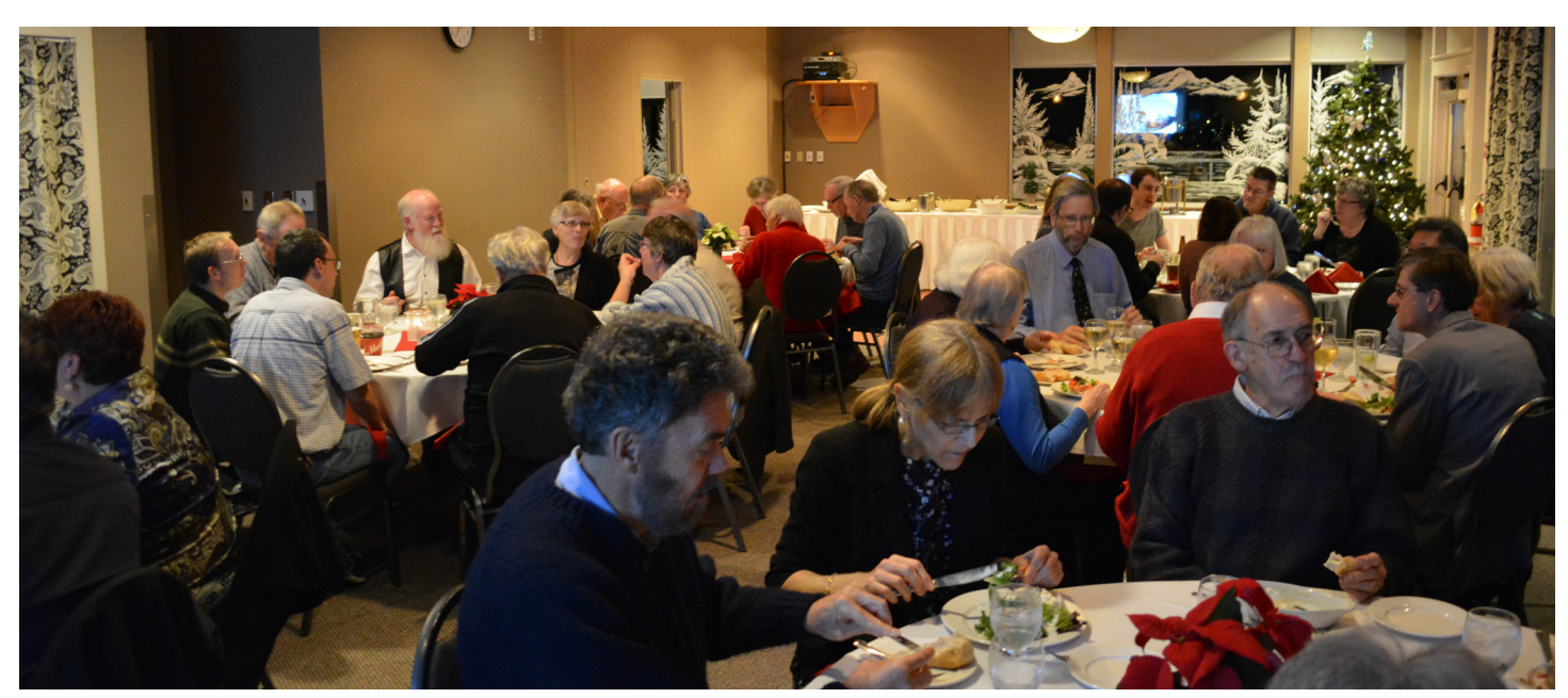
Victoria Centre AGM

The Centre of the Universe planetarium was well used giving numerous shows each evening. A virtual-reality display by the NRC proved very popular. These evenings were held in partnership with the Friends of the DAO (FDAO) and the NRC. A thank-you event for the volunteers was held on September 15.