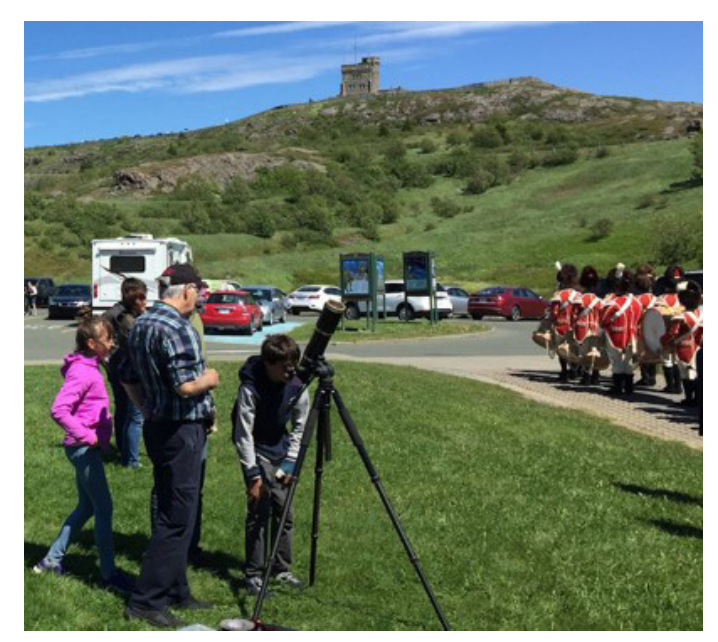
Signal Hill Historic Sites Days, July 7.

our Executive team. Our Annual Star Party at the Preserve is very well attended