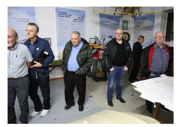
Aviation Museum tour