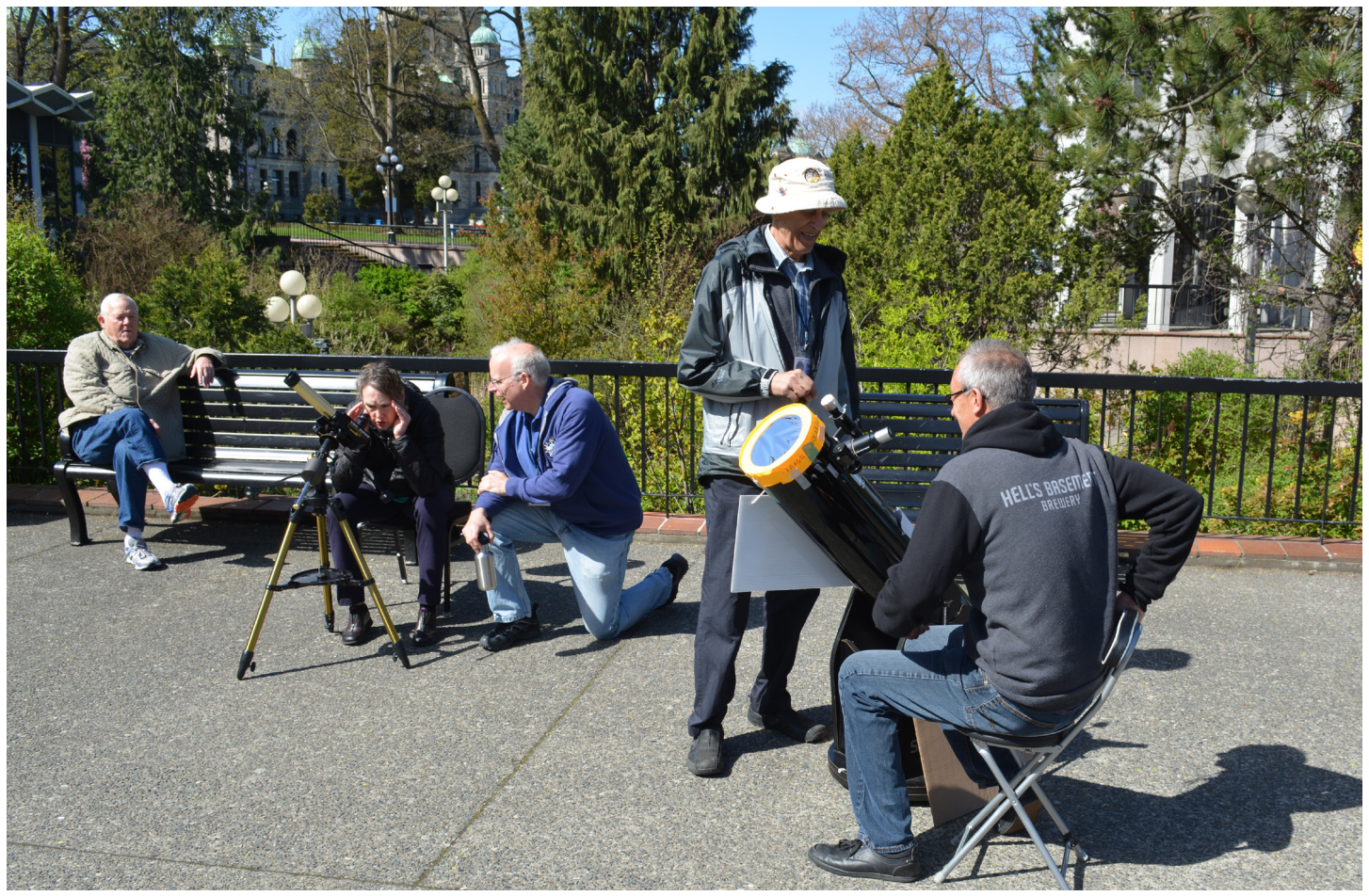
National Star Party