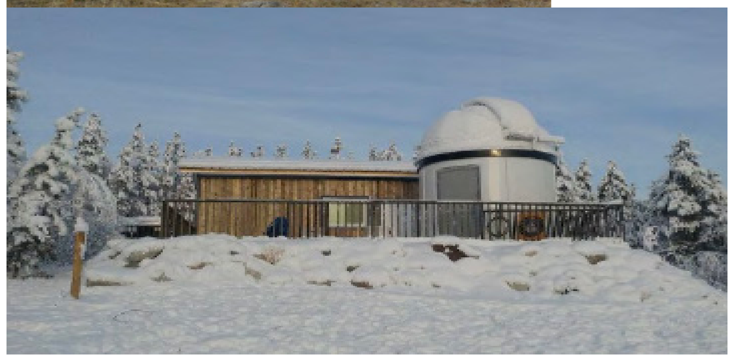
Below:AND...as of completion in February 2019

Left:With construction of our Education Centre in progress (September/October 2018)