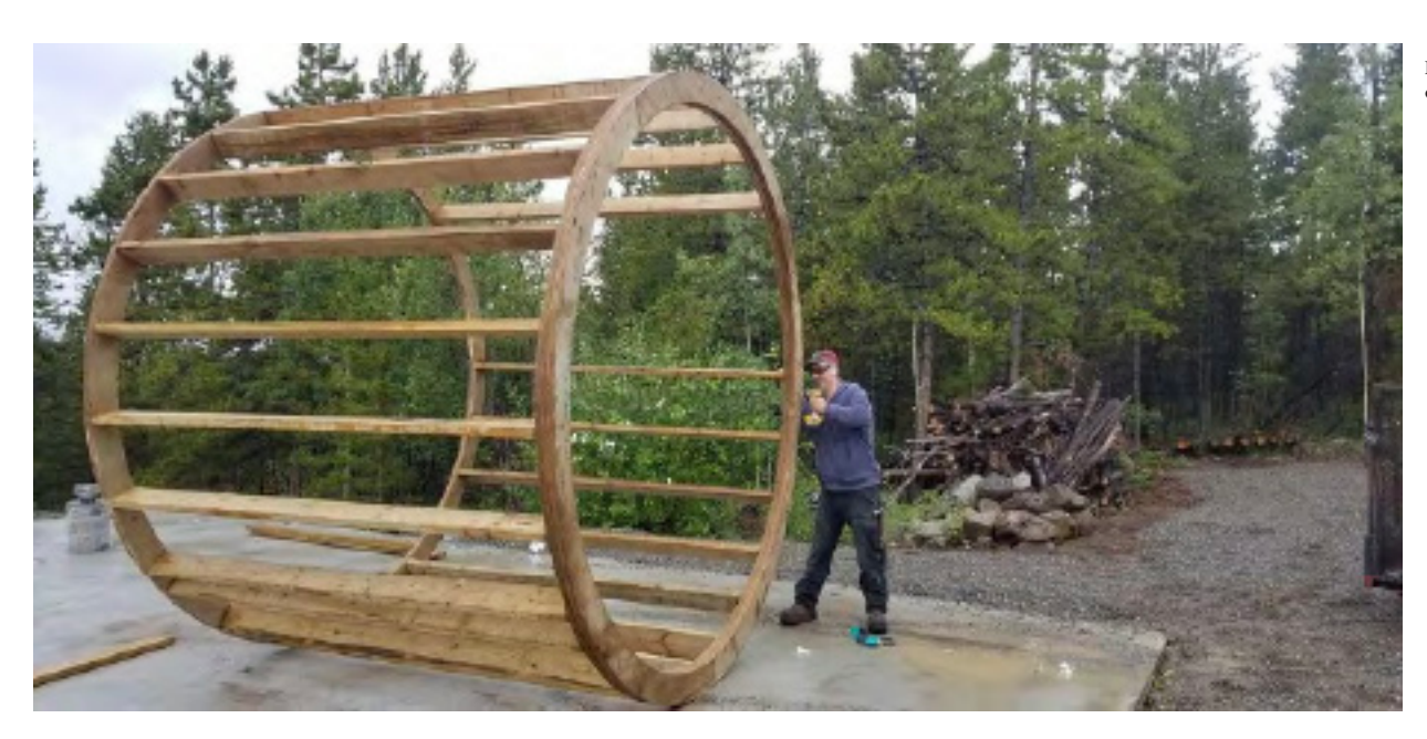
Frame of the new observatory wall

During the year, representatives of the Yukon Centre appeared in media several times: radio interviews and newspaper articles, including CBC North, Radio Canada BC, Radio Canada Nunavut, Yukon News , Front Page photo and article in WhatsUp Yukon .