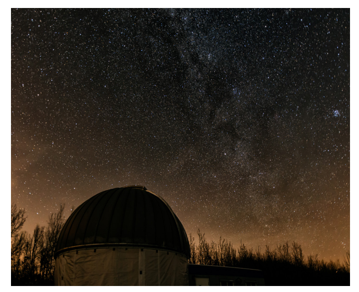
Night Sky over the BNLO Observatory

on the shores of Lake Annette. Festival goers were treated to the constellations and the celestial jewels within them by our astronomers under pristine dark skies, despite a glaring Moon. We had the added luxury of observing Saturn early on in the evening, a big, bright Mars, and a very illuminating waxing gibbous Moon. We also had the opportunity to setup and operate a telescope at the Dark-Sky Festival VIP event at the Jasper Park Lodge, wowing approximately 60 special guests with close-up views of the Moon. Tourism Jasper counted approximately 600 festival goers at Lake Annette during the first evening, and approximately 900 during the second evening.