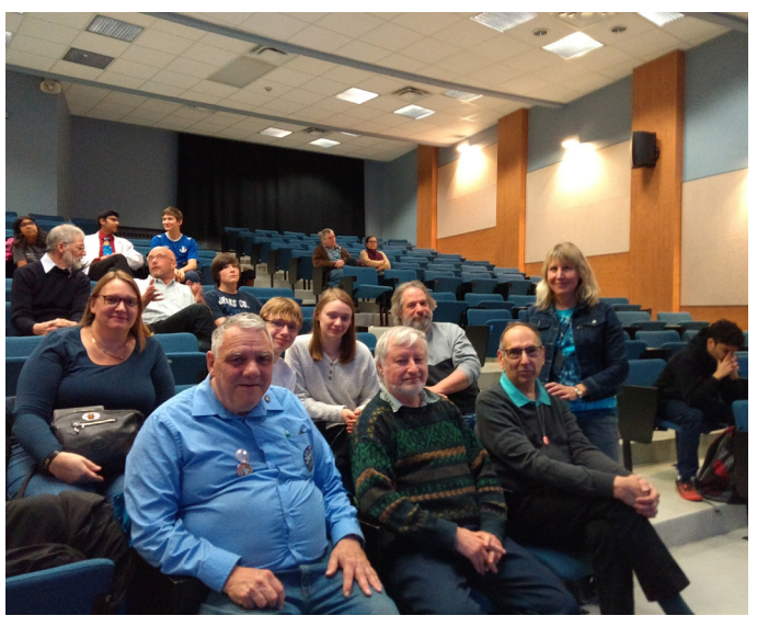
The AAR group in the audience