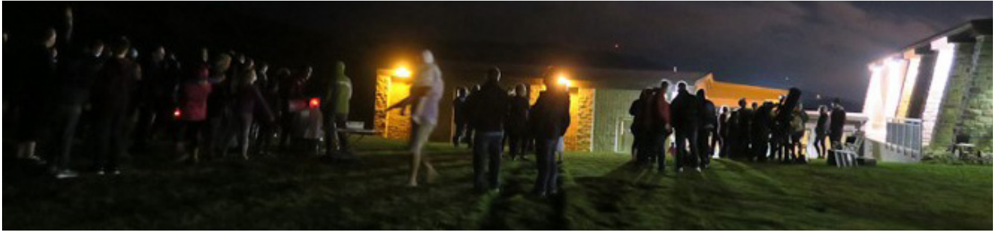
National Star Party, September 13. Image by Randy Dodge