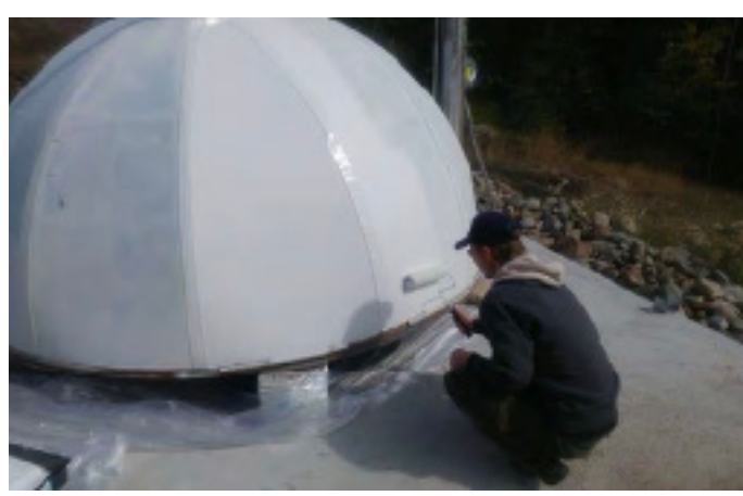
YAS volunteers contributing to construction