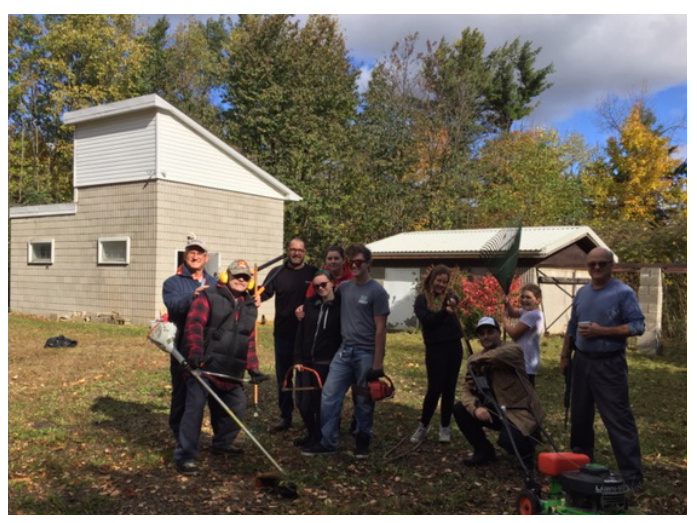
Our semi-annual observatory clean-up (fall 2018).