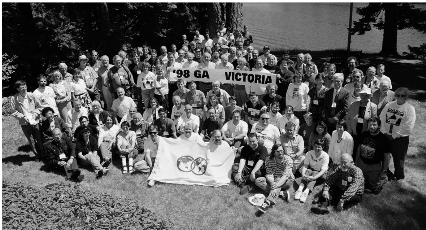
Group photo from the 1998 General Assembly held at Pearson College of the Pacific, near Victoria, B.C.